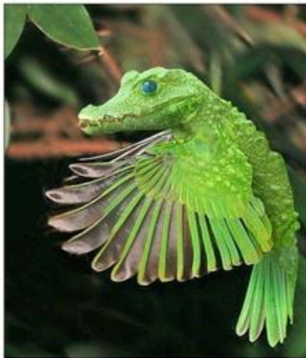
(above) The no-see-um - truly vile!

This is a photo magnified 1000 x's of a Florida-No-See-Um "